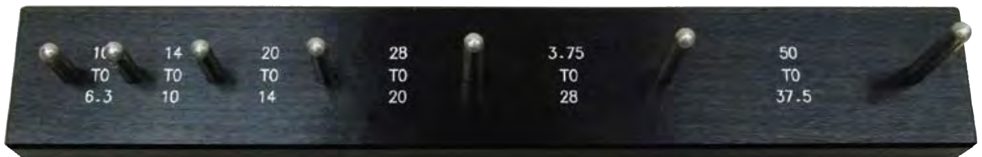
Length Gauge (Elongation Index)